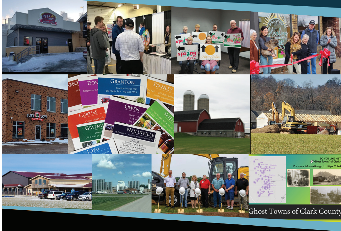
Ghost Towns of Clark County