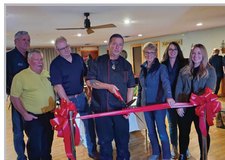
Hereford House Supper Club, Greenwood