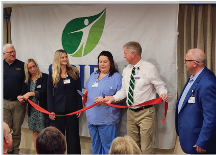
Aspirus Cardiac Rehab Unit Expansion, Stanley