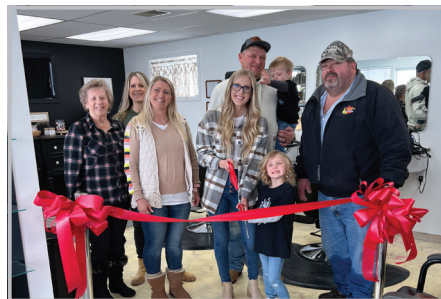
West Side Salon, Thorp