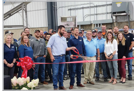
Loos Machine Plant 2, Colby