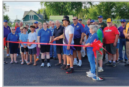
Pickleball & Basketball Courts, Withee