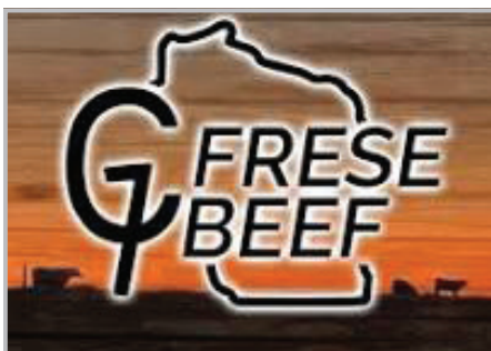
Frese Natural Angus Beef, Greenwood