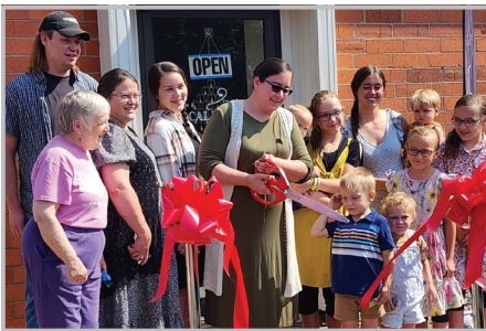
The Local Thrift Co, Thorp