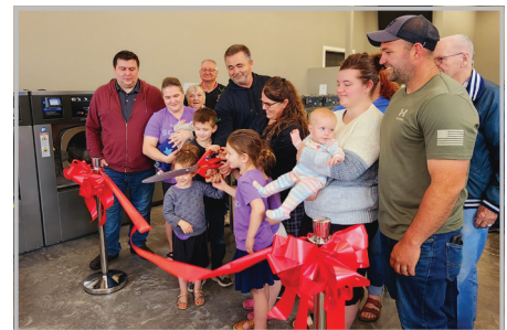
Withee Toss & Wash, Withee