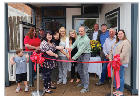
Homestead Realty, Neillville