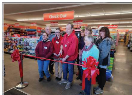
Family Dollar & Dollar Tree, Abbotsford