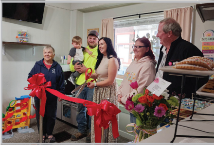
Little Wildflowers Childcare Center, Owen