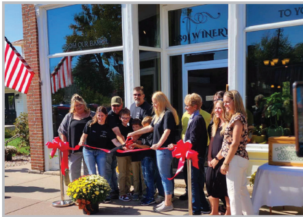
1891 Winery, Greenwood