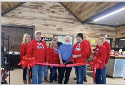
Pac Knife Sales, Dorchester