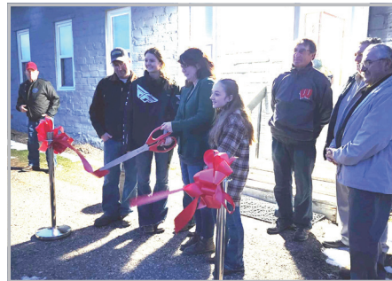
Blue Moon Vintage, Thorp