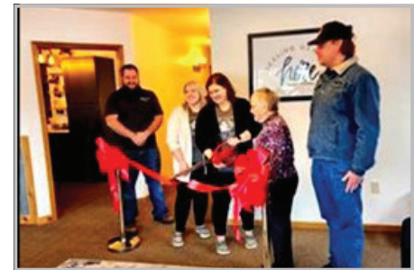
Thorp Family Chiropractic, Thorp