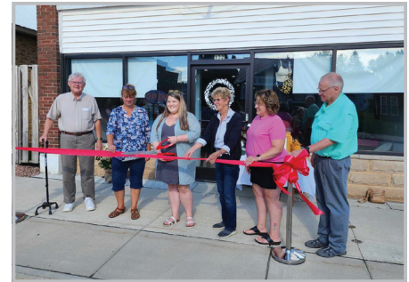
All Boutique, Loyal