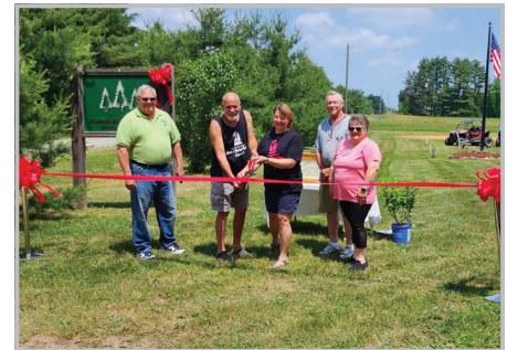
Bookers Northern Escape, Neillville