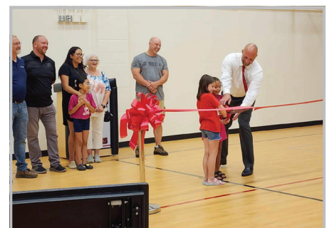
FEMA Building Expansion, Abbotsford