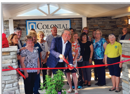
Colonial Health & Rehab Expansion, Colby