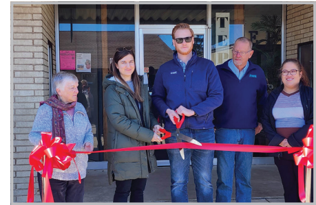
RWE Renewables, Abbotsford