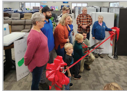
Abbotsford Appliance, Abbotsford