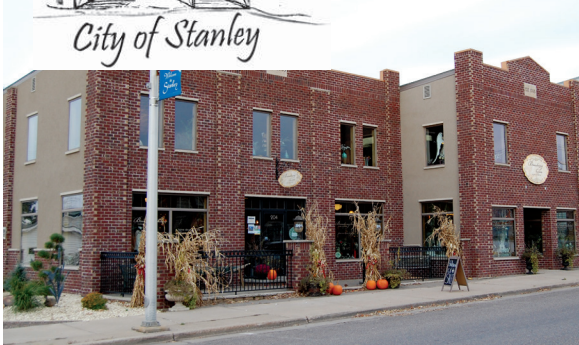
BROADWAY HOME DECOR AND FLORAL